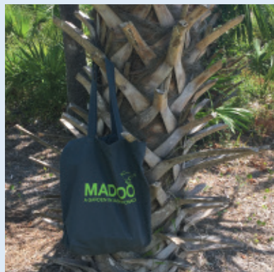
Hilton Head, South Carolina

Right here in Sagaponack of course! But our new tote travels the world and has inspired an Instagram campaign. Get yours as a gift with a membership of $250 or over and take a shot of it in your favorite locations. Tag with #totes_madoo and we'll publish them in The Chat.