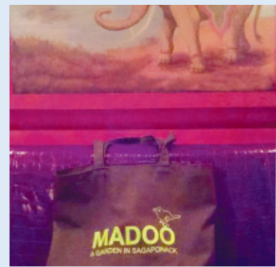
Doubles Club, New York City