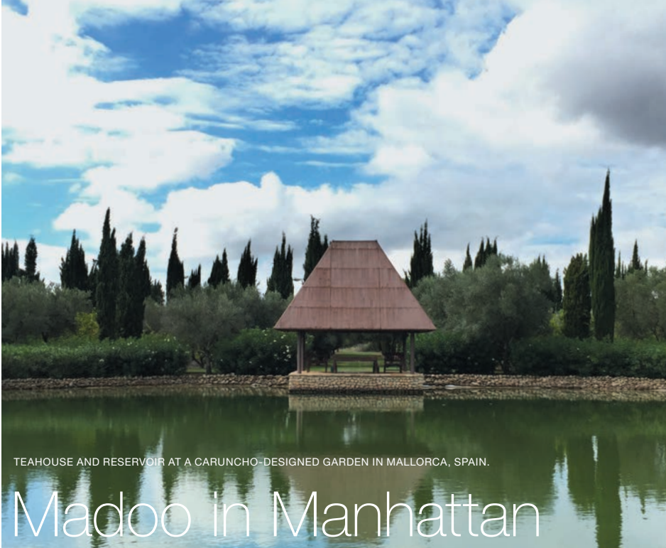
TEAHOUSE AND RESERVOIR AT A CARUNCHO-DESIGNED GARDEN IN MALLORCA, SPAIN.

All lectures in the summer house studio at 12pm. A reception will follow.