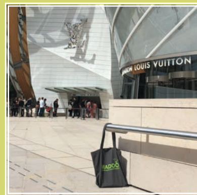
Où Est Madoo? Fondation Louis Vuitton, Paris, France