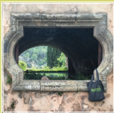
On Ets Madoo? Jardines de Alfabia, Mallorca, Spain

Where in the World is Madoo? Right here in Sagaponack of course! But our new tote travels the world and has inspired an Instagram campaign. Get yours as a gift with a membership of $250 or over and take a shot of it in your favorite locations. Tag with #totes_madoo and we'll publish the top three.