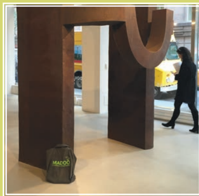
Non Dago Madoo? Eduardo Chillida exhibition at the Ordovas pop-up gallery, New York City