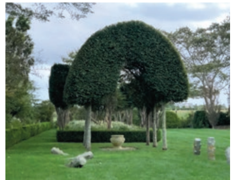
TOP: A technician from Pond Masters cleaning the secret garden fountain.